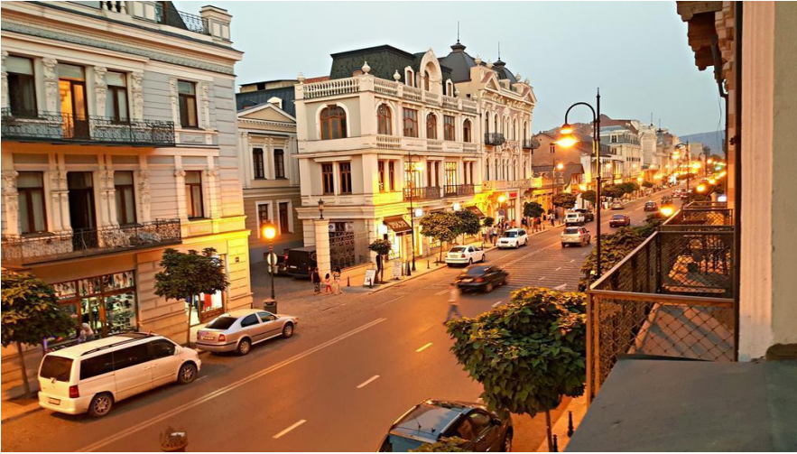
Marjanishvili (Turkish Street)